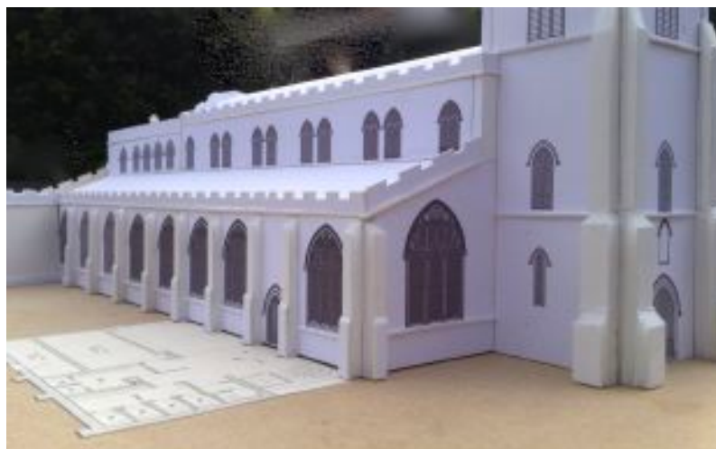
Completed during isolation, a 1:100 scale architectural model to help with visualising the future extension etc.

Meanwhile although our architects are presently furloughed we hope to have some more detailed plans soon showing the design of the internal alterations that we put to them in our brief last year which will include installing a good heating system, replacing the floor and moving the organ to the west end, their plans will also include the design and layout of a proposed extension with modern toilet and kitchen facilities and additional meeting rooms. We understand their work is fairly well advanced and this period of time has given them breathing time to reflect on the design best suited for St Mary's.